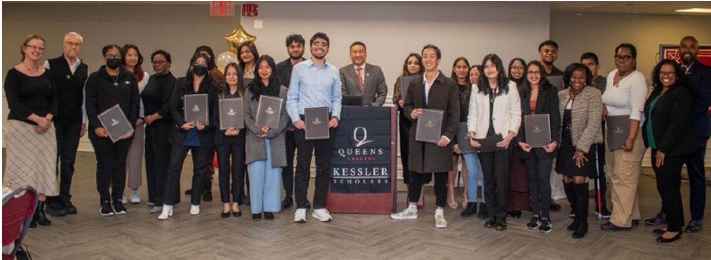
Kessler Scholars Program