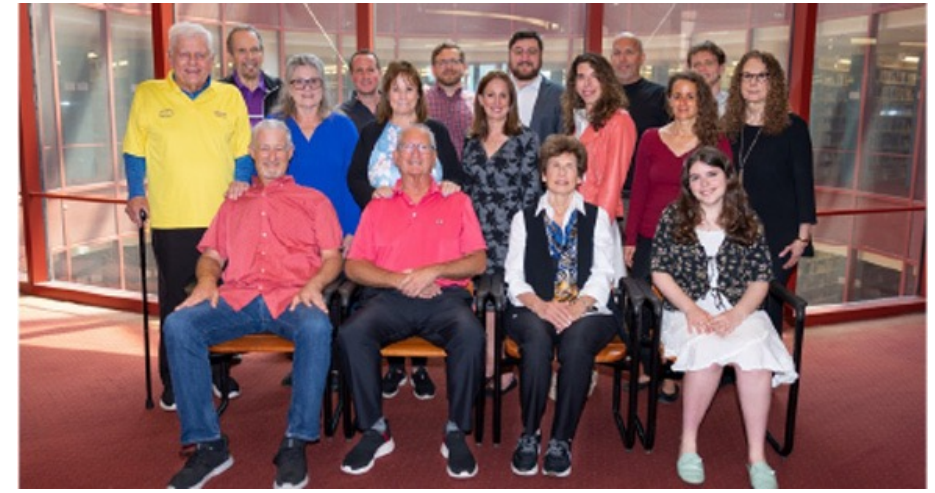
Ruth Hollander Award in Jewish Studies