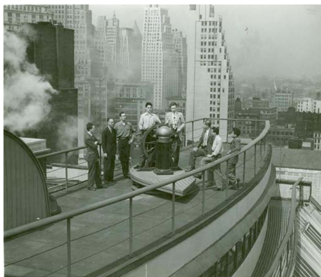
Bridge navigation instruction on top of the roof of SCI's headquarters at 25 South Street in Lower Manhattan.

Thayer will continue to process the records of the Institute at Queens College. The collection consists of paper documents, photographs, artifacts and publications collected over SCI's history. Highlight items include 19th century journals from the chaplains of SCI's three floating chapels, letters from long-time SCI Board member Franklin D. Roosevelt and a photograph collection dating back to the late 1800s.