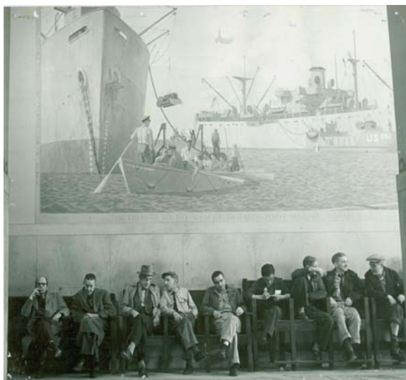
A mural painted in the lobby of 25 South Street depicting the Merchant Marine involvement in the World War II Normandy invasion.